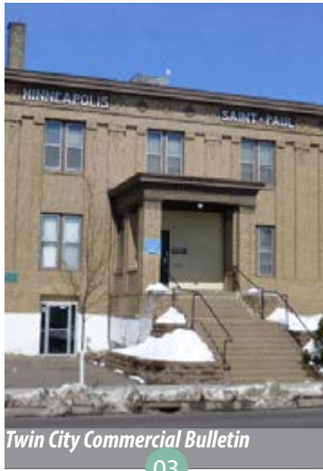
Twin City Commercial Bulletin

Historically significant as a combined showroom/warehouse associated with the Midway furniture industry.