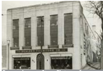
Brown-Iasners Store Fixtures Co.