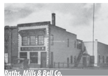
Ray-Bell Films Building

The city's earliest, intact neighborhood theater, culturally significant as a Prohibition-era nightclub, and architecturally significant as an example of the work of prominent St. Paulite Franklin Ellerbe.