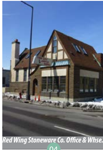
Red Wing Stoneware Co. Office & Whse.

Historically significant as a printing and office facility associated with Midway manufacturing and warehousing operations.