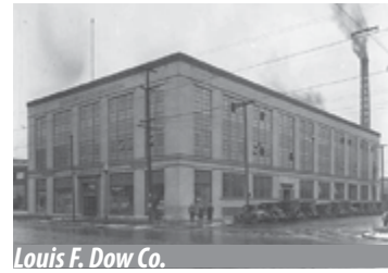
Louis F. Dow Co.

Historically significant as an example of a combined showroom and warehouse and as a unique example of a Period Revival style commercial building.