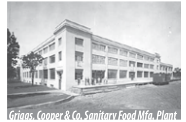
Griggs, Cooper & Co. Sanitary Food Mfg. Plant

Historically significant as an early warehouse, built by and for a firm engaged in the manufacture and distribution of building products. It features "fireproof" reinforced-concrete construction designed for large floor loads.