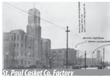
St. Paul Casket Co. Factory