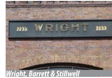
Wright, Barrett & Stillwell

Historically significant in the areas of commerce, architecture, and engineering—a major Midway industrial building erected during the area's burst of growth after World War I.