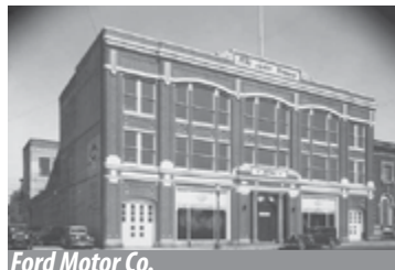
Ford Motor Co.

One of few remaining early 20th-century dairies in the city, the building is significant in the areas of agriculture, commerce, and architecture.